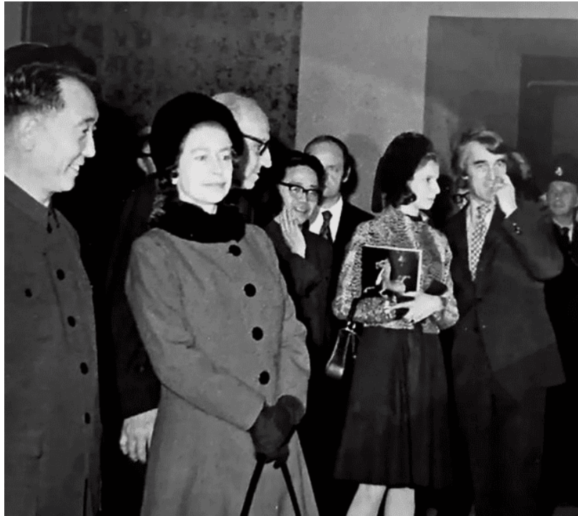
Figure 7. On November 8, 1973, Queen Elizabeth II of the United Kingdom visited the "Exhibition of Archaeological Finds of the People's Republic of China", accompanied by Chinese Ambassador to the UK, Song Zhiguang, among others.

“The Exhibition of Archaeological Finds of the People's Republic of China” in London closes with over 770,000 visitors, breaking all records for art exhibitions held in London. The Chinese Ambassador to the UK, the Chairman of The Times, and over 200 ambassadors and other diplomats from more than 60 countries were invited to visit the exhibition. On the evening of January 21, 1974, the Chinese Ambassador to the UK, Mr. Song Zhiguang (1916-2005), hosted a banquet for the exhibition. Mrs. Margaret Hilda Thatcher (1925-2013), who was then the Minister of Education and Science and later became the Prime Minister of the United Kingdom, attended the event upon invitation. During this period, driven by a “profits-first” diplomatic policy towards China 21 , the British government enthusiastically utilized “the Exhibition of Archaeological Finds of the People's Republic of China” as a platform to convey a friendly diplomatic stance towards China. This largely aligned with China's cultural diplomacy intentions, achieving a mutually beneficial diplomatic objective. Other aspects of bilateral engagement also increased during this time, such as the record-breaking trade total of $632.16 million USD in 1973, rising to $725.87 million USD in 1974 19 . Therefore, “the Exhibition of Archaeological Finds of the People's Republic of China” serves as