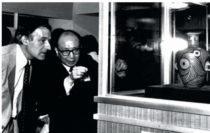
Figure 3. Visitors viewing the exhibition