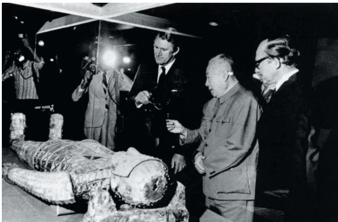
Figure 5. During the Exhibition of Archaeological Finds of the People's Republic of China" in Australia(January to June 1977), Wang Yeqiu introduces the exhibits to Australian Prime Minister Fraser.