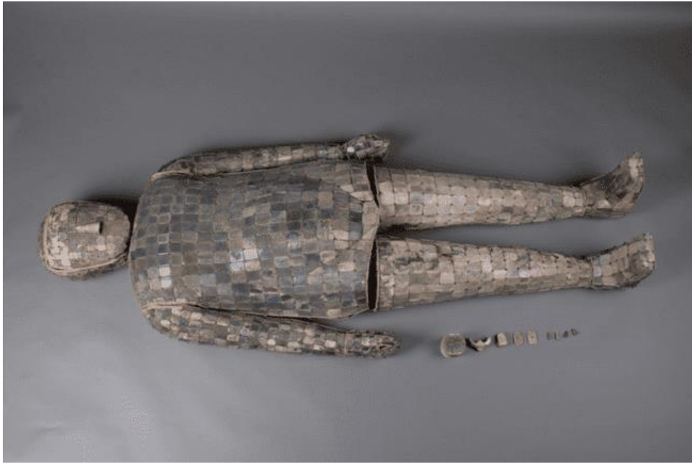
Figure 4. "Jade Suit Sewn with Gold Thread" (Length: 182 cm, Shoulder Width: 52 cm) from the Western Han Dynasty, Henan Museum Note: Excavated in 1985 from Tomb No. 1 at Xishan, Yongcheng, Shangqiu, Henan Province. The jade suit is composed of sections for the head, torso, arms, hands, legs, and feet, with two additional triangular arm ornaments. The body had decayed by the time of excavation, and the jade suit was flattened by soil pressure.