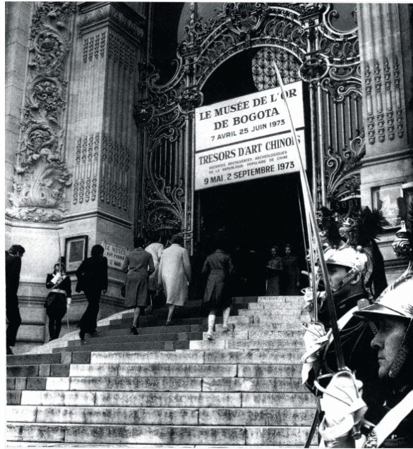
Figure 1. Visitors entering the Petit Palais during the exhibition in France